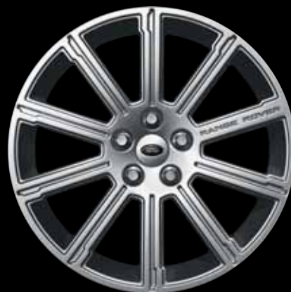
20-inch 10-Spoke Alloy Wheel (Rim only) Sparkle Silver Finish* — LR010666 2010 vehicles onward

Center Cap: Sparkle Silver Finish — RRJ500030WYS** High Gloss Silver Finish — RRJ500030WYT**