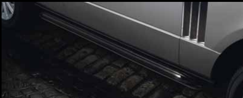
Side Protection Tubes – Black Steel Can be fitted with or without front mudflaps. VJB002510