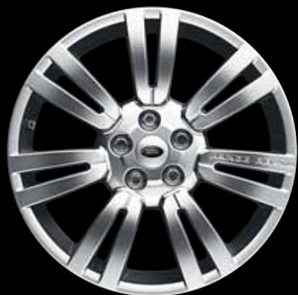
20-inch V-Spoke Alloy Wheel (Rim only) Sparkle Silver Finish* — LR008766 2010 vehicles onward

A set of striking alloy wheels for the new 2010 Range Rover can add that dash of personalization. A number of unique designs have been created to surpass the most demanding requirements while extreme winter conditions are addressed with a snow traction system.