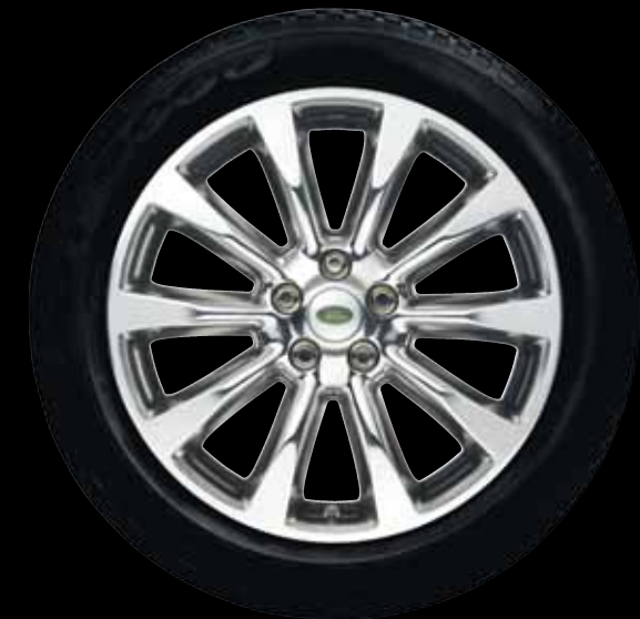
20-inch 10-Spoke Alloy Wheel (Rim only) Polished Finish — 2006-09 gasoline and TDV8 vehicles only 315MHz — RRC503940MMM

Center Cap: Bright Polished Finish — RRJ500060MUZA Bright Polished Finish — RRJ500060WYU**