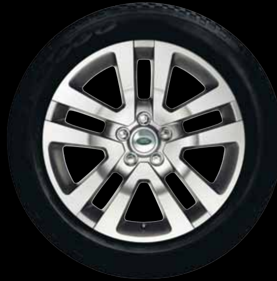
20-inch Bi-Colored Alloy Wheel (Rim only) 2006-09 gasoline and TDV8 vehicles only — LR005241

Center Cap: Bright Polished Finish — RRJ500060WYU**