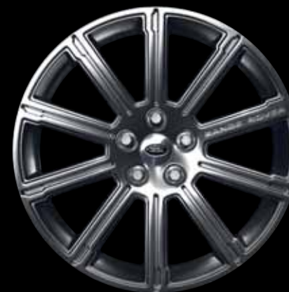
20-inch 10-Spoke Alloy Wheel (Rim only) Polished Finish* — LR017926 2010 vehicles onward

Center Cap: Sparkle Silver Finish — RRJ500030WYS** High Gloss Silver Finish — RRJ500030WYT**