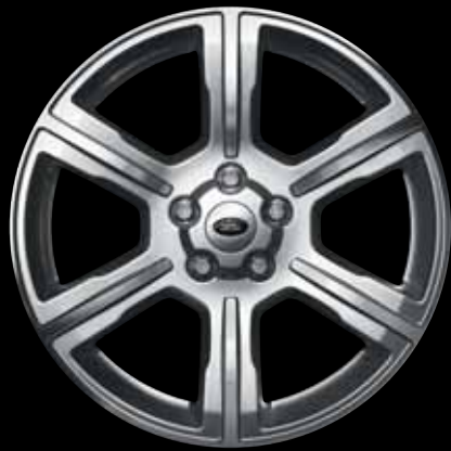
20-inch 6-Spoke Alloy Wheel (Rim only) Diamond Turned Finish* — LR012835 2010 vehicles onward

Recommended Tire: Continental Conti Cross UHP 255/50 R20 109V AT-S