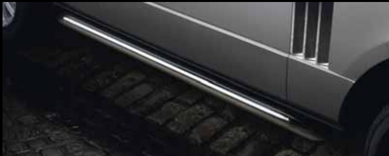
Side Protection Tubes – Stainless Steel Can be fitted with or without front mudflaps. VJB001230