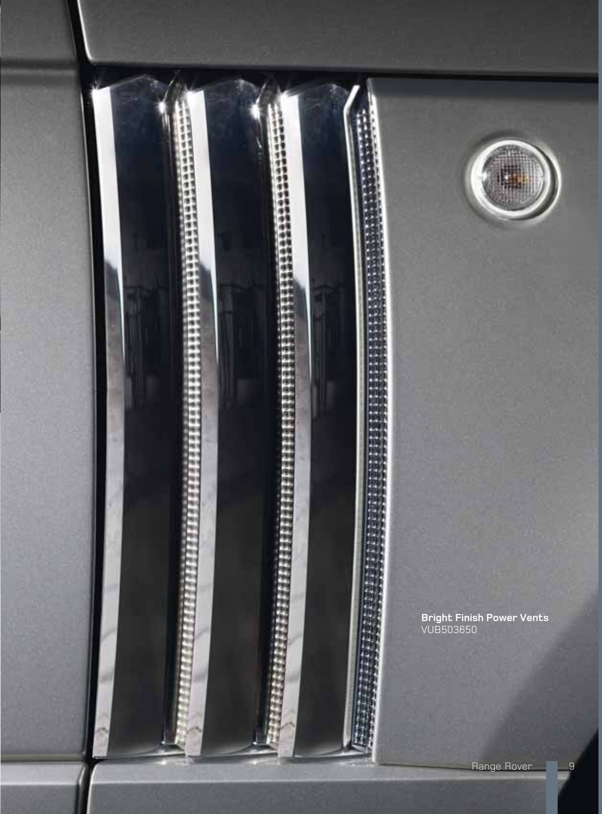
Bright Finish Power Vents VUB503650

These functional power vents add a bold touch to your Range Rover and can be painted to match your vehicle's body color. Paintable — VUB002200 Chromed — VUB002200MMM