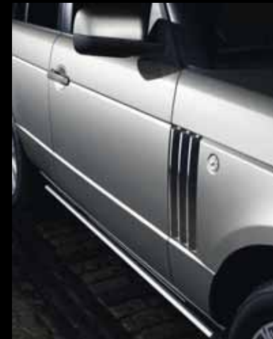
Deployable Side Steps (stowed)

*The Electronic Control Unit (ECU) and Wiring Harness must be ordered with deployable side steps.