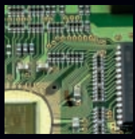
Digital Signal Processing provides the same digital resources available to the professional recording engineer, allowing our automotive acousticians to re-master the sound that was originally created in the recording studio.