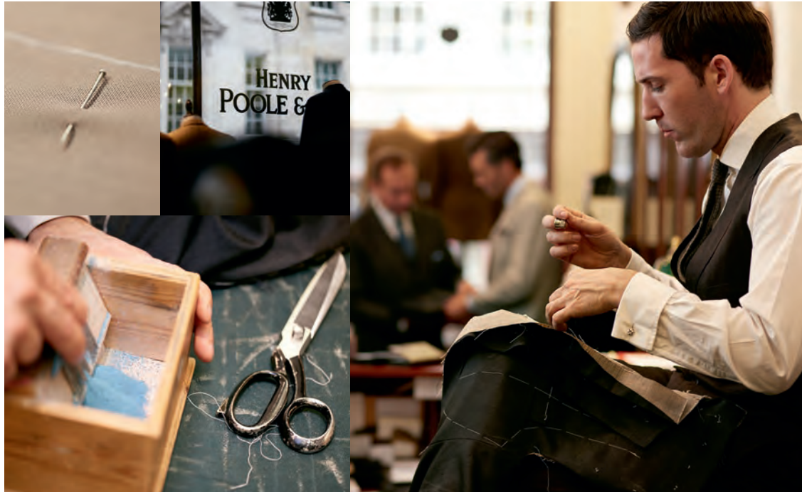
Henry Poole & Co, Saville Row, London

Craftsmanship never goes out of style and some forty years of expertise in designing Range Rover is now manifest in the Autobiography Black model. From the unique front grille to the side and auxiliary vents, every tailored aspect whispers refinement and attention to detail.