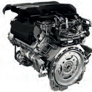
3.0L V6 SUPERCHARGED